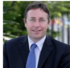
Achim Steiner Executive Director United Nations Environment Programme